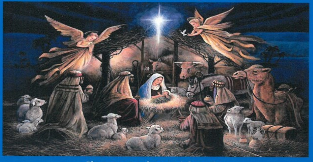
Please see over for more information

The Second Rite of Reconciliation will be held on Tuesday 10 December 2019 at 7:00pm. Here we come together as a community to reflect. Priests hear individual confession and give absolution